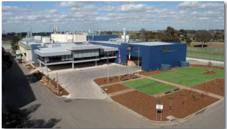
The home of Guardian® – Securrency International in Craigieburn

The success of the Guardian® technology is becoming recognised globally. After a detailed feasibility study to consider the proposal for the establishment of a security polymer substrate plant in Mexico, Securrency International has entered into a joint venture with Banco de Mexico to establish a substrate plant in Queretaro – two hours from Mexico City – which will be commissioned in early 2009.