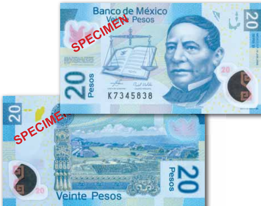
Mexico's redesigned 20 Pesos polymer banknote