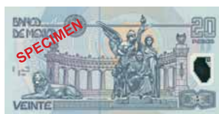
The original polymer 20 Pesos has been a very successful note, experiencing a current counterfeiting level of less than 1 part per million