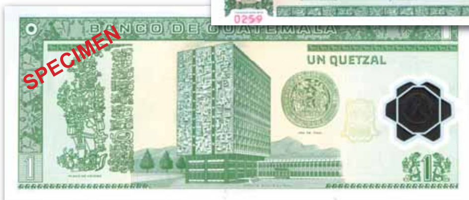
Guatemala's new 1 Quetzal polymer banknote