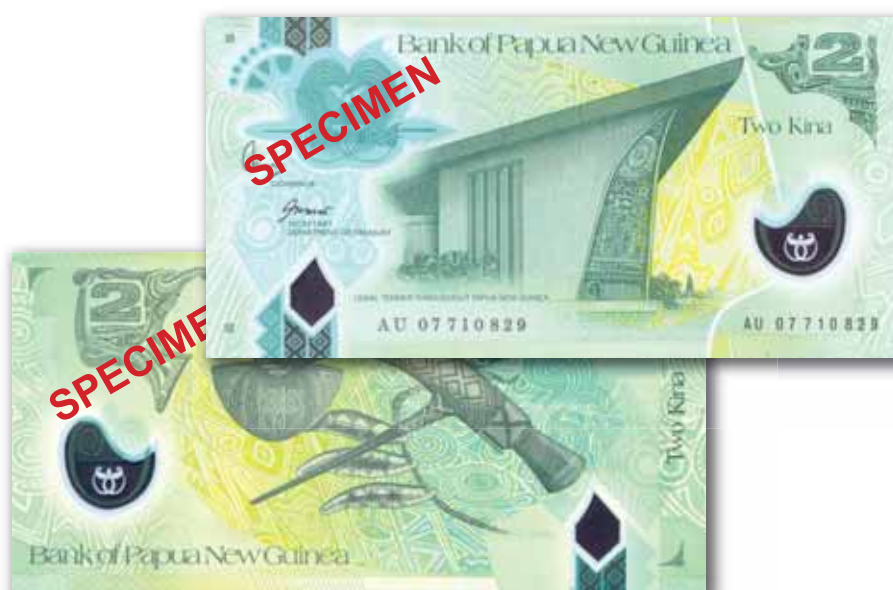
Papua New Guinea's redesigned 2 Kina polymer banknote